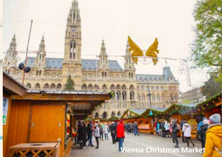
Vienna Christmas Market