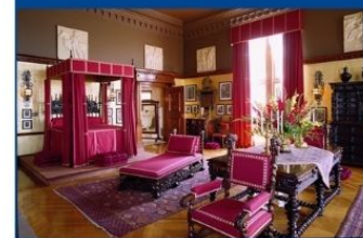
Grand Victorian architecture.