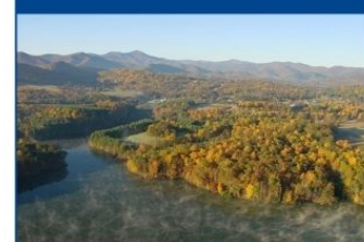
View the Blue Ridge Mountains.

Day 3: Enjoy a Continental Breakfast before departing for a GUIDED TOUR OF ASHEVILLE. Downtown Asheville features more Art Deco architecture than any other southern city outside of Miami Beach. You will also see the magnificent ST. LAWRENCE BASILICA. Later you depart for home... A perfect time to chat with your friends about all the fun things you've done, the spectacular sights you've seen and where your next group trip will take you!