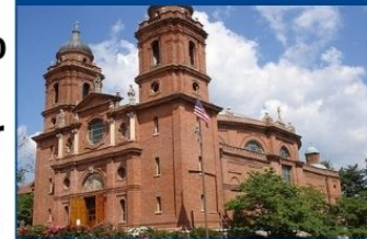
Magnificent St. Lawrence Basilica.