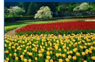
One of the Biltmore's many gardens.