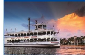
Sightseeing Cruise down the "Venice of America"