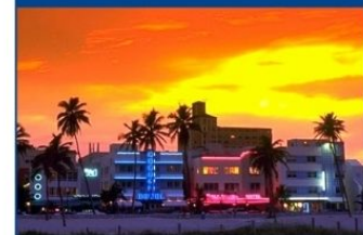
Exciting and Colorful Miami Views

Day 6: After enjoying a Continental Breakfast, you'll depart for home... a time to chat with your friends about all the fun things you've done, the great sights you've seen and where your next group trip will take you!